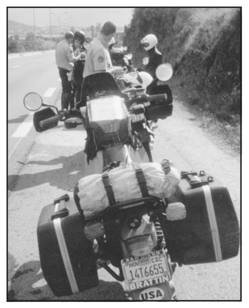
Then they got stopped by the Fuzz, who were riding GS's. It was a friendly Corsican meeting.