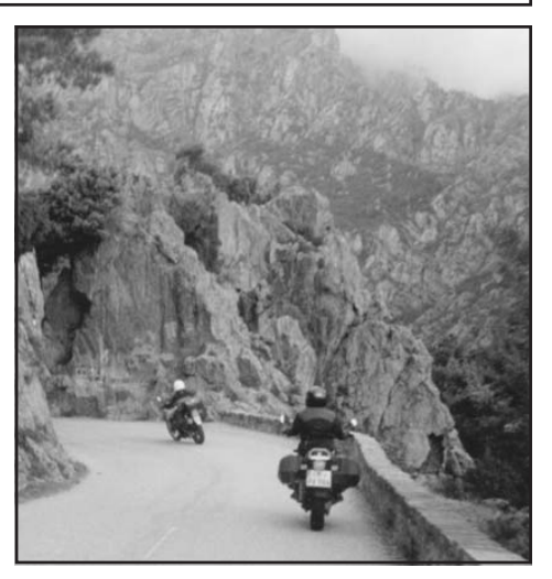
...so they could play on roads like this on Corsica.