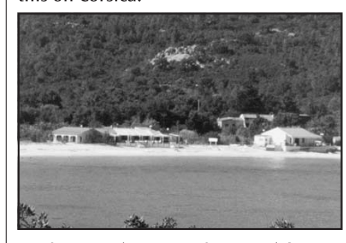
The San Diegans and Court Fisher found this home right on the beach in Corsica, and right at the foot of mountain roads.