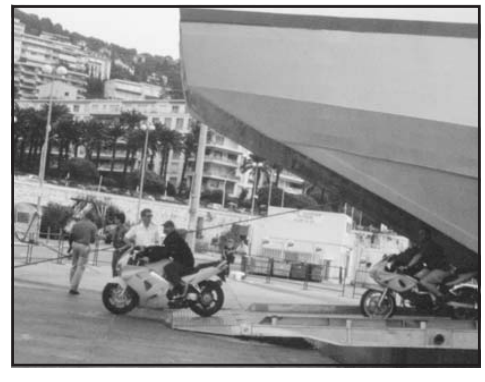
From the Alps, the San Diegans took a ferry to Corsica. Here, bikes come out of the ferry's maw...