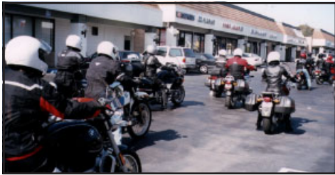
Lined up for a Sunday ride from Giovanni's. Would you believe to Idylwild?