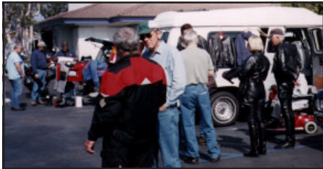
Another Sunday at Giovanni's witnessed a swap meet with many treasures changing hands.