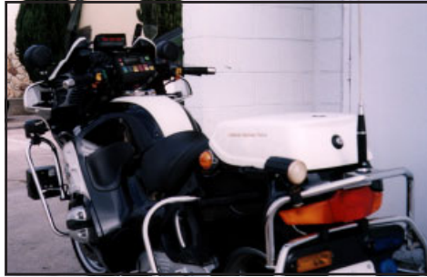
They got you coming and / or going. (Note front and rear facing radar...)