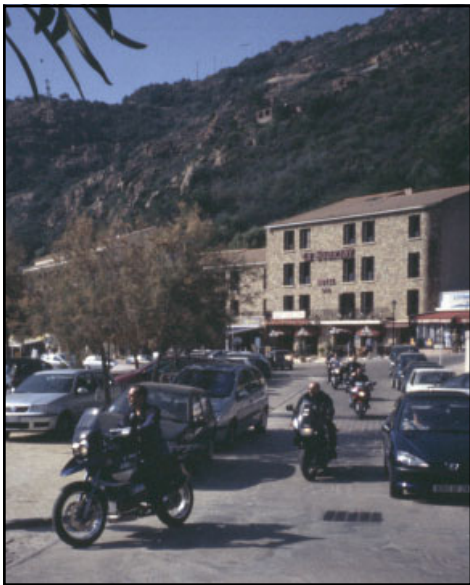
There are a lot of bikes on Corsica.