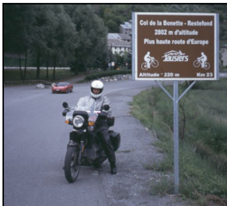
Don Picker stopped for a picture at the sign for the Col de la Bonnette claiming to be the highest road in Europe.