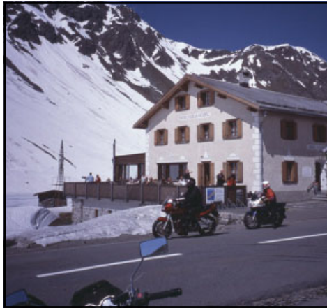
Watching the bikes go by from a table over there on the terrace, the San Diego riders paused for refreshment atop Fluela Pass in Switzerland.