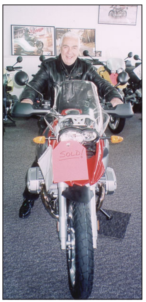
Don't know. Would the "ALP KING" license plates fit on this bike?