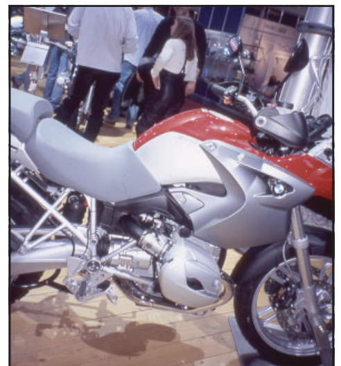
Back at Munich's Intermot show, I noted this aluminum valve cover on the new R1200GS.