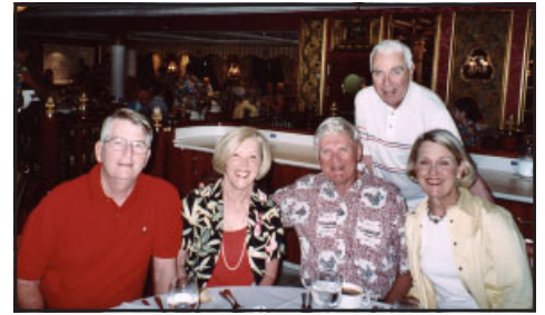
Five distinguished members of the BMWOCSD cruised down the Mexican Riviera recently. Of course, that involved some dining in the elegant Versailles Room, one of eleven dining rooms on the Norwegian Star. They took in Acapulco, Zihuantenajo, Puerto Vallarta and Cabo San Lucas.