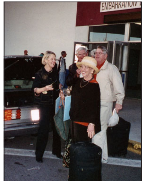
They did not ride to the ship in L.A., they arrived at the Port of Los Angeles via Mercedes.

Motorcycle sales in the U.S. in 2004 topped one million. BMW sales slipped.