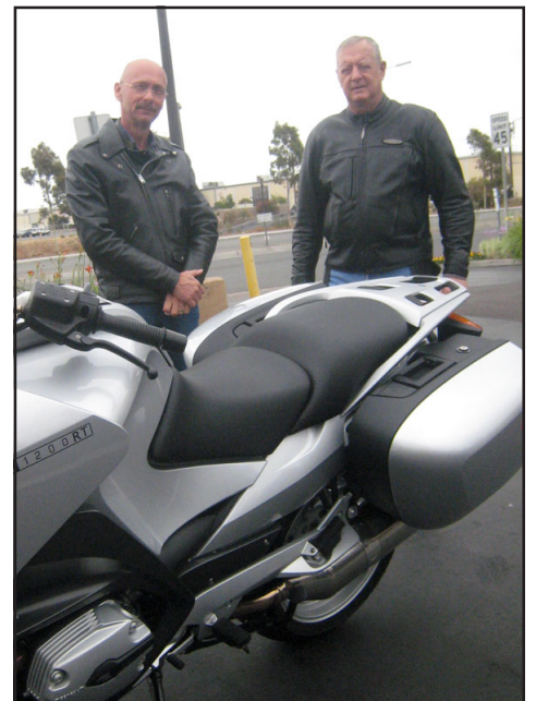
He's had this nice RT a while, and just made it to Giovanni's.