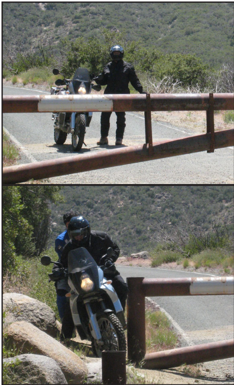
What's a little gate to a dedicated San Diego dirt rider?