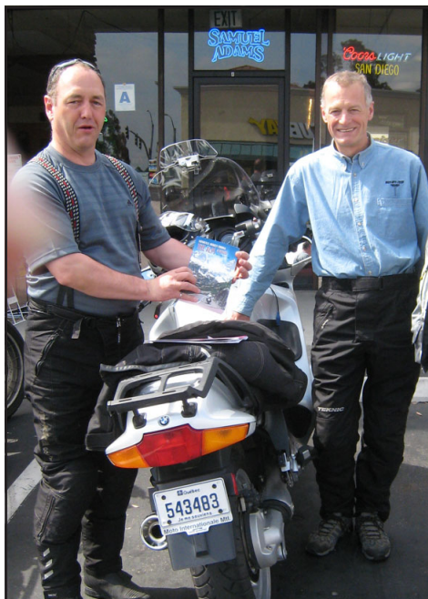
All the way from the Gaspé peninsula of Quebec where it must have been cold and wet, these two riders made it to Giovanni's for breakfast.