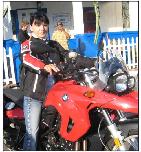
She came all the way from Quebec to show off this unobtainium F650GS.