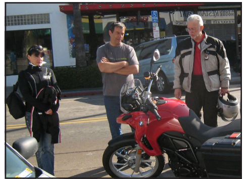
Then she kindly stepped aside, so the breakfast crowd in colorful OB could get a good look at the bike.