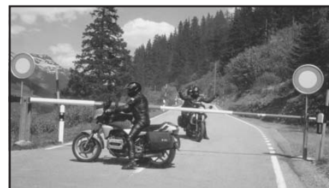
Then there was this very official Swiss barrier, with international "Do Not Enter" signs on the San Bernadino Pass. We had to take the tunnel!