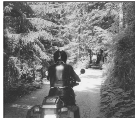
Like this tractor dragging a load of logs requiring 110 percent of the pass road,

There were a few impediments on the roads.