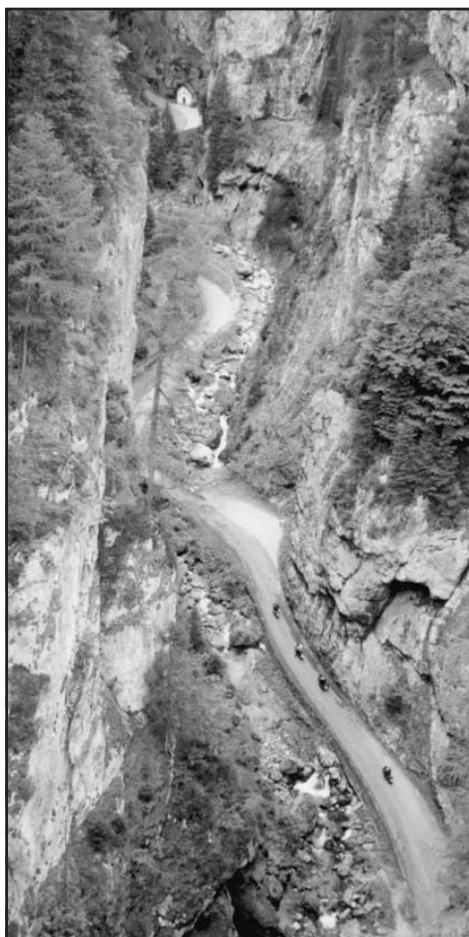
The Sottoguda Gorge in the Dolomites of Italy,

We claim we ride the Alps for the motorcycle friendly roads like these: