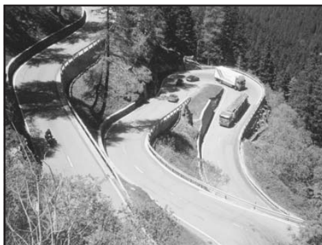
...and the Maloja Pass in Switzerland. (Note: There are no double-yellows, and the bikes made it by those trucks on the Maloja in jig time.)

There were a few impediments on the roads.