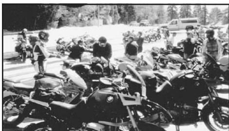
One Saturday was so lovely that Mother's Kitchen atop Palomar Mountain was full up with bikes.