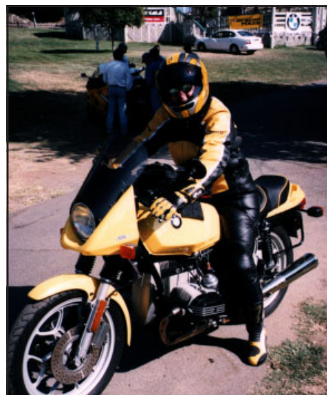
Attracting attention at Oktoberfest was this lady on a yellow R65LS with matching leathers, boots, and helmet. She's a new rider from Vista.