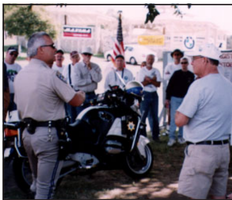
And the CHP officer gathered a mostly rapt audience as he discussed riding and ticketing. He admitted that his personal bike is a Harley.