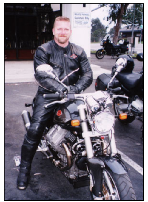
That was one day. Then there's the Moto Guzzi.