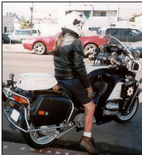
A new recruit for the C.H.P.? He might have to put on long pants and trim the pony tail.