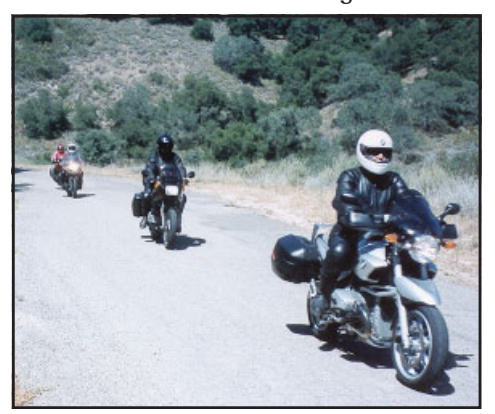
Heading for Santa Maria, as ten or so worthies of the BMWOCSD did recently, there's N3 across the top of L.A. County, and then a nifty race across Cerro Noroeste from Frazier

The soft ice place across from the Sheriff's office at Pine Valley makes real thick chocolate malts ... not shakes, malts. Worth a journey. Then spin out Pine Creek Road where that rocky ford has been made into a smooth one-lane-wide bridge.