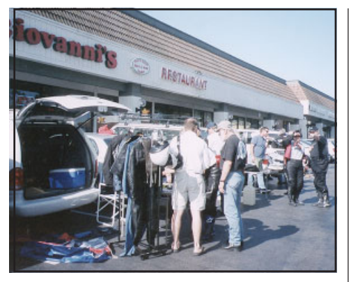
Tailgaters at Giovanni's aren't cooking ... they're marketing "swap" meet stuff.