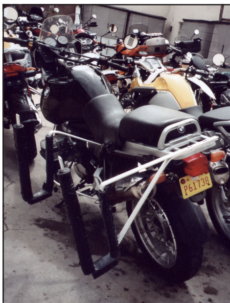
There's not a lot of surf in New Mexico, so this rider from there is out with his surf board neatly stowed in the left side rack.