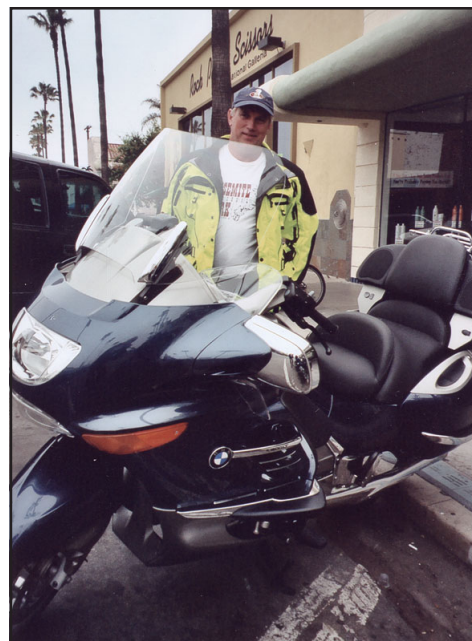
Only on Fridays. Only at Margarita's do you get to meet a new member on his new LT.