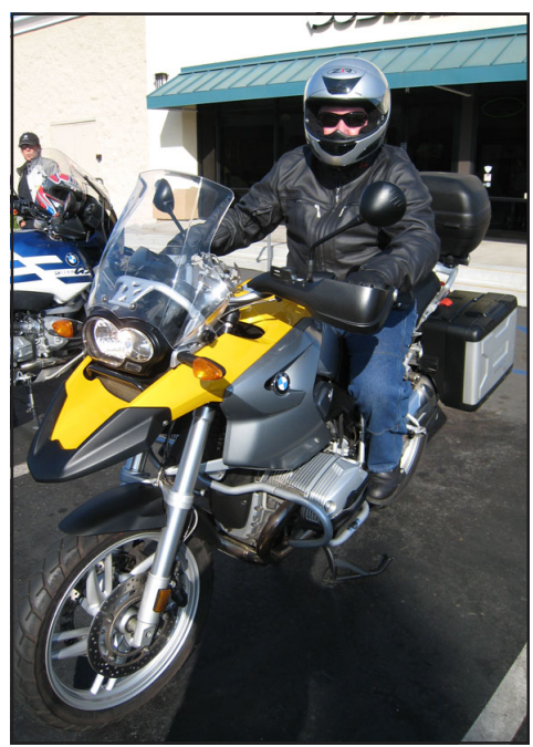
At last, a new BMW, with an unidentified rider.