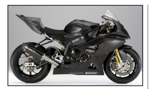
No. Say it isn't so. This reported 1000cc bike doesn't even have a Roundel.