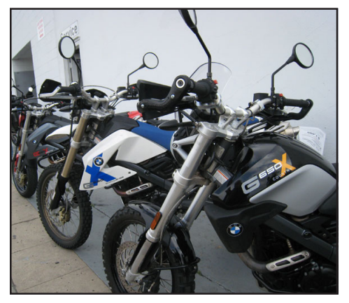
And that ain't all. Apparently all these "X" bikes are supposed to be BMW's.

In spite of all these new bikes, BMW bike sales for the first quarter of 2008, are apparently down about 8% from last year, 21,000 vs. 23,000.